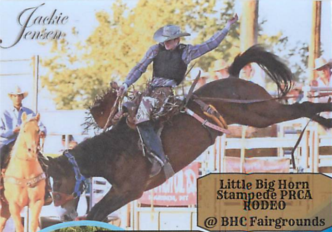
Little Big Horn Stampede PRCA RODEO @ BHC Fairgrounds